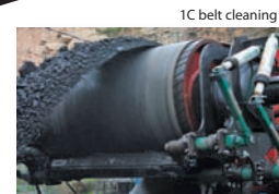
1C belt cleaning