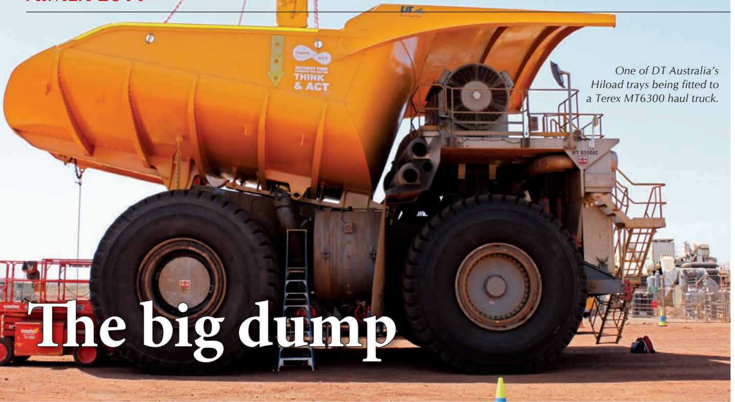
One of DT Australia's Hiloal trays being fitted to a Terex MT6300 haul truck.