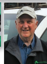
Experienced Support Team