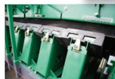
Impact Saddles & Containment